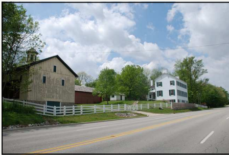
Huddleston Farmhouse is now home to the Huddleston Farmers' Market

Cambridge City —On June 2, the Huddleston Farmers' Market opened at the Huddleston Farmhouse/National Road Heritage Site. Sponsoring the market is Indiana Landmarks' Eastern Regional Office. This market is unique in the way it reconnects visitors to the agricultural heritage of the Huddleston Farm.