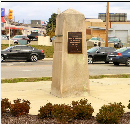
Above: 1916 DAR Obelisk marking the National Road and the Michigan Road.